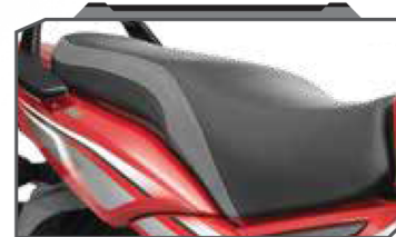
PREMIUM DUAL-TONE SEAT