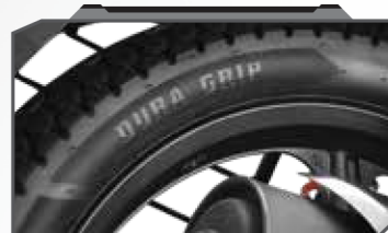
DURA GRIP TYRES