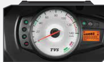
MULTI-FUNCTIONAL DIGITAL CONSOLE