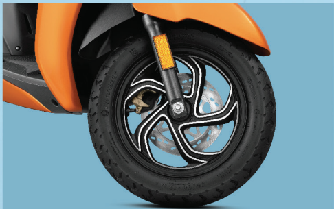
DIAMOND-CUT ALLOY WHEELS