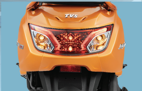
ELEGANT TAIL LAMP