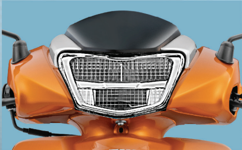
STYLISH LED HEADLAMP WITH VISOR