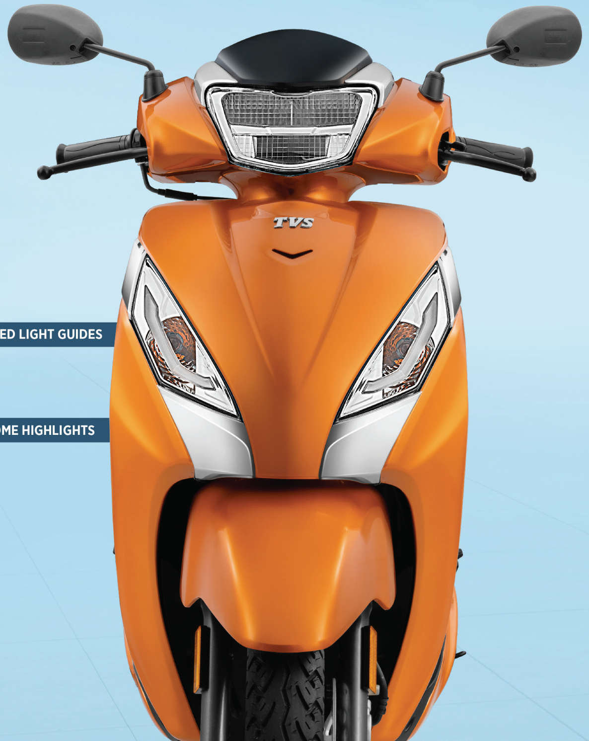
SIGNATURE LED LIGHT GUIDES